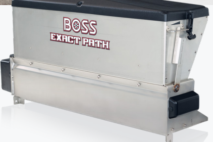
EXACT PATH® 2.5