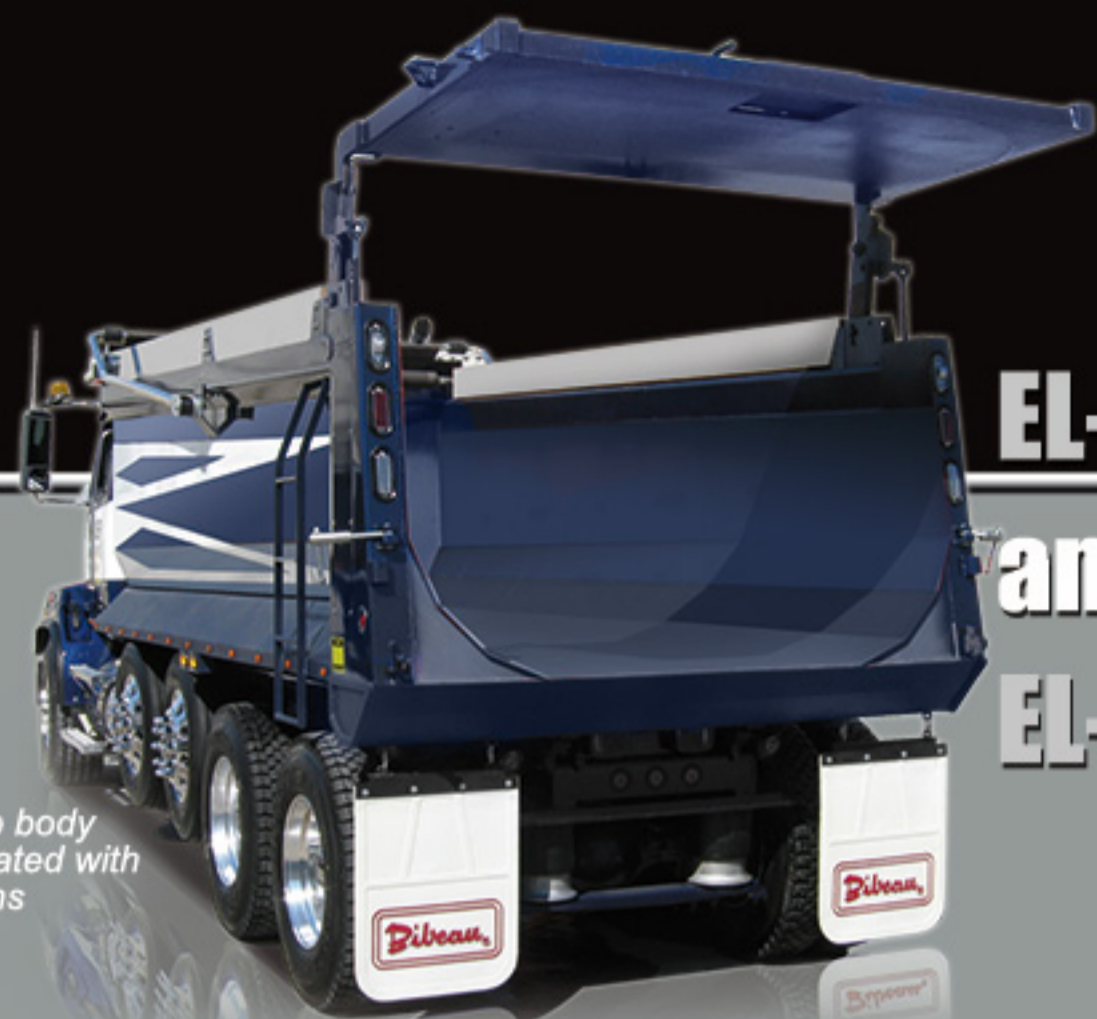
Dump body illustrated with options