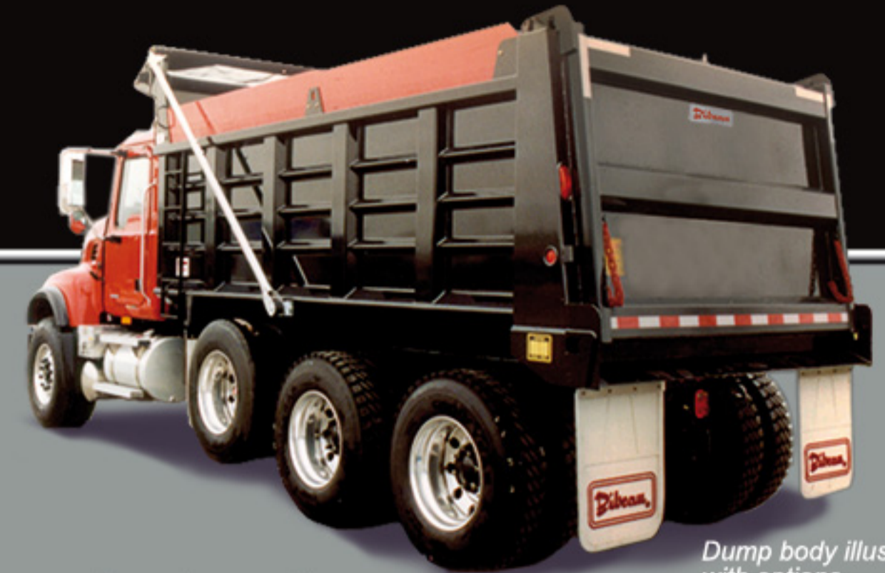
Dump body illustrated with options

If your application requires an elliptical design, the EL series built of AR450 is for you.