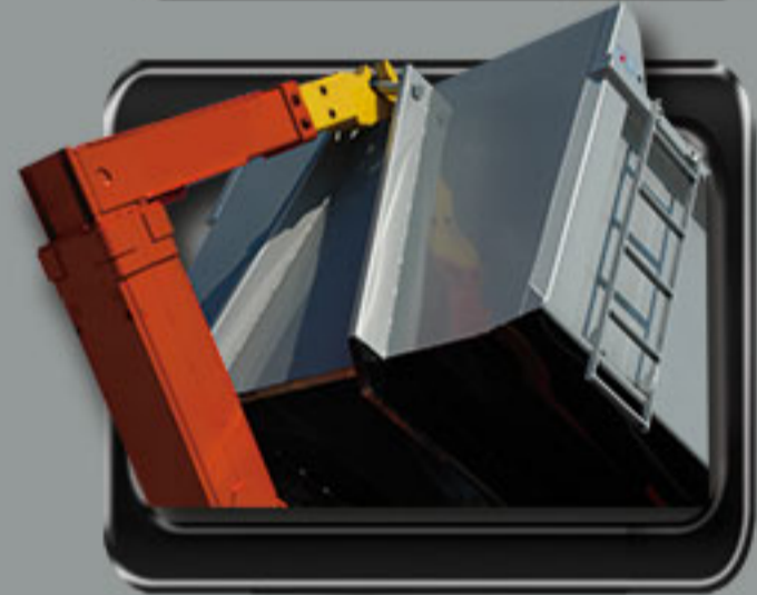
Hook lift / Roll-Off