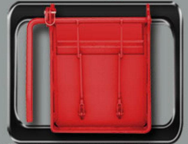
Coal (grain) door