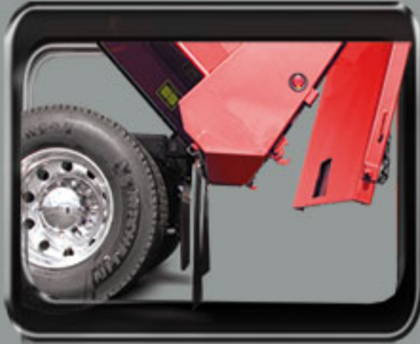
45 degree bumper