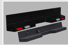
Bumpers - Lighted & Non-lighted