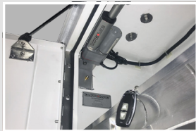
MAGLOCK Keyless Locking System