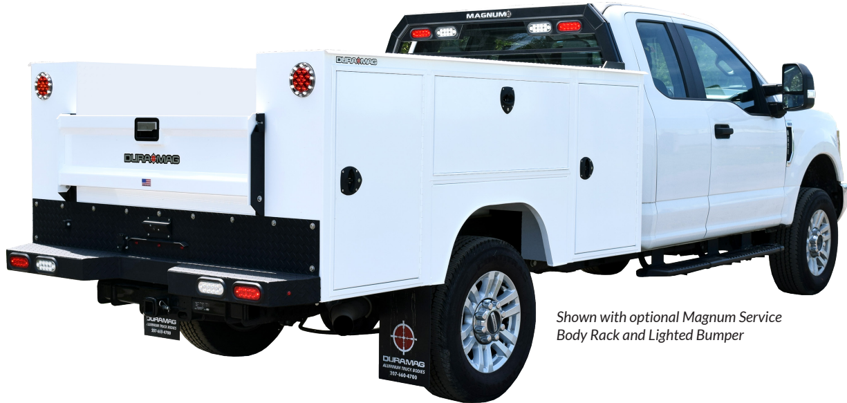
Shown with optional Magnum Service Body Rack and Lighted Bumper