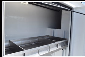
Pass Thru Compartment Shown Between Front and Middle Boxes