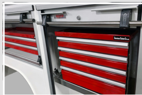
Slide-out Tool Boxes