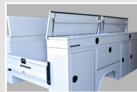
Flip Top Compartments