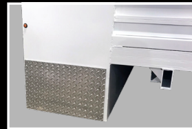
Tread Plate Splash Guards on Front Wall