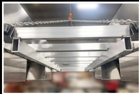
Strongest Understructure in the Industry