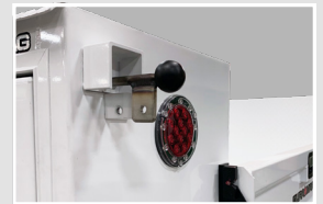
Traditional Rod Lock System