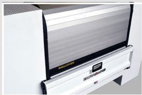
Roll-up Tonneau Covers