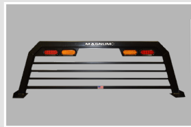
Magnum Rack with Optional Lights