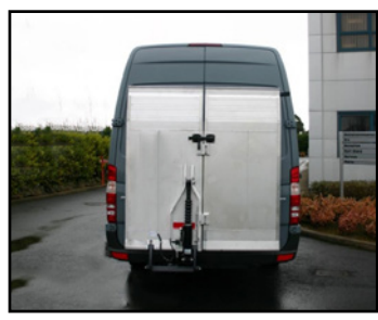
WHZ open and stowed for multiple large cargo deliveries.