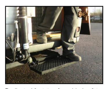
Dedicated footstep for added safety.