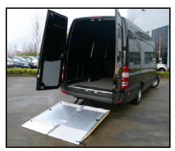
WHZ open and unloaded.

Notice below, the added convenience of being able to unload heavy, large loads, as well as gain access to the rear door for smaller, light deliveries.