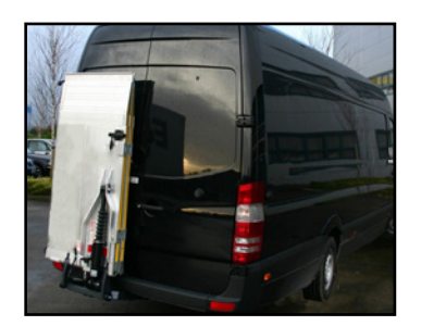
WHZ in stowed position, allowing driver access to rear door.