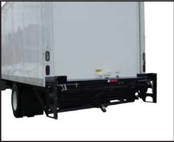
WFL platform in stowed position