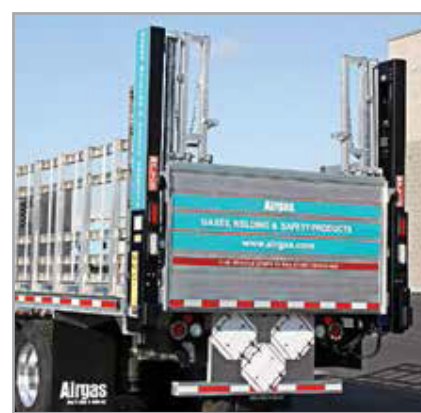
WDVBG Series Gate in stowed position