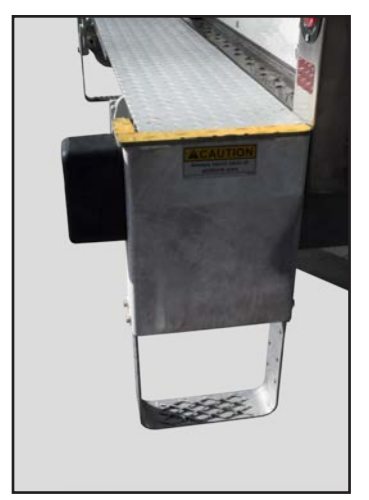
Optional Galvanized Single Step Dock Bumper with Bumper Block.

ORDER YOUR LIFTGATE TODAY, AND WE'LL SHIP IT TOMORROW.