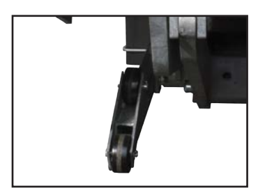
Bolt-on Parting Bar shown above.