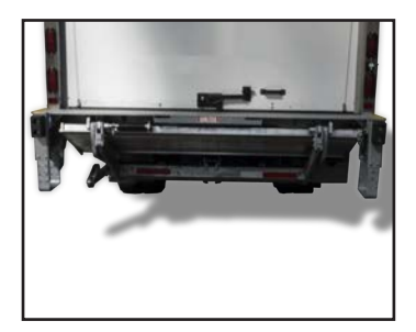
EM Series Gate in stowed position.