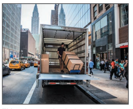
EM series gate in platform loading position. This liftgate is ideal for quick deliveries in tight spaces.

Platform auto adjusts as it lowers from bed level to ground level