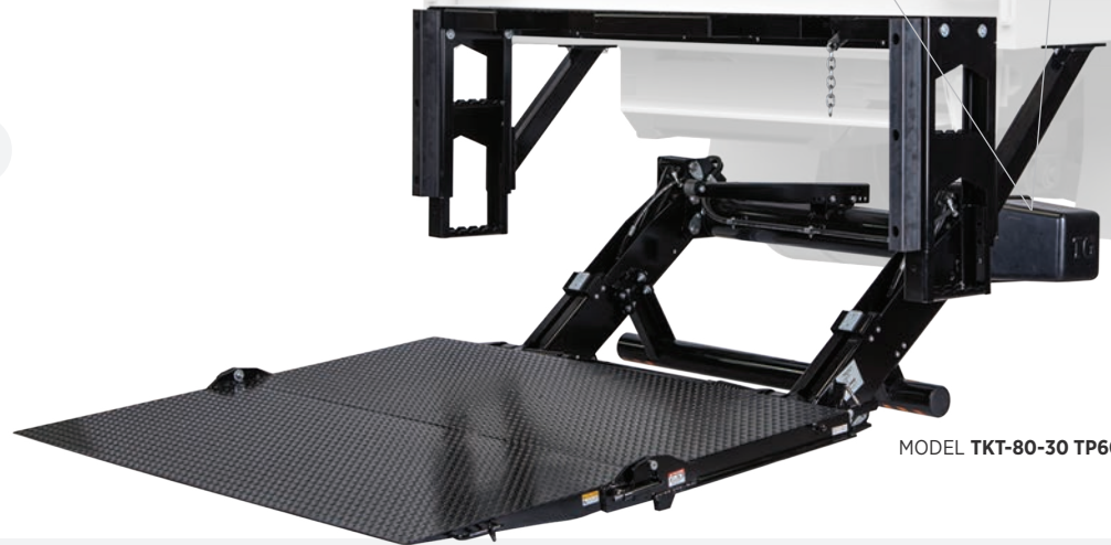
MODEL TKT-80-30 TP60