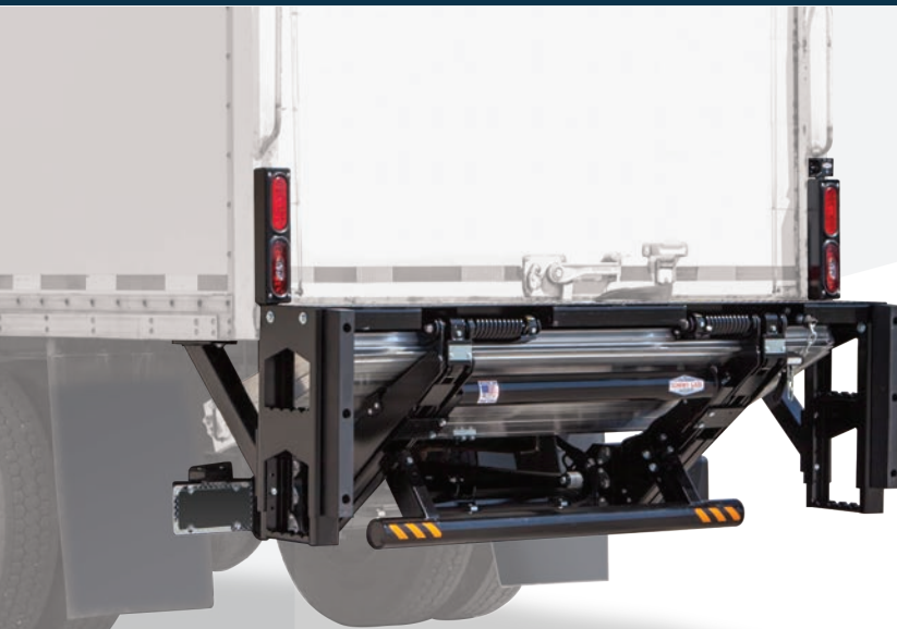
MODEL TKT-80-30 EA60