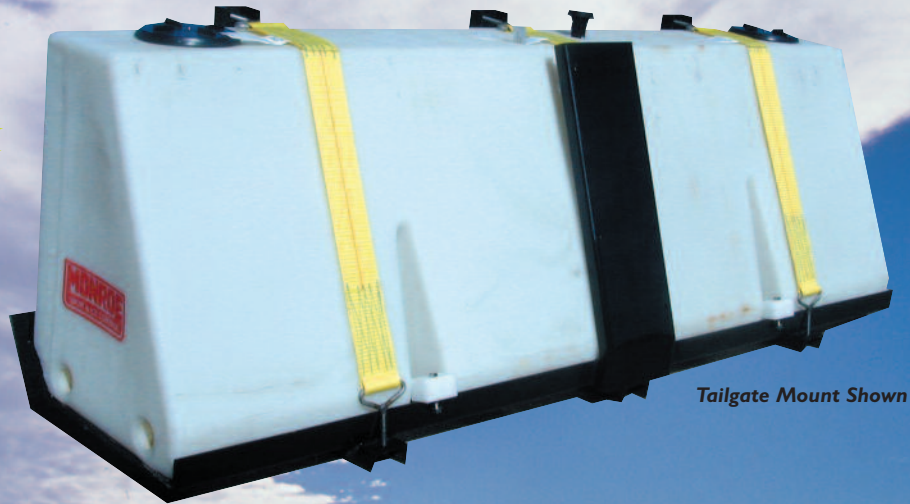
Tailgate Mount Shown