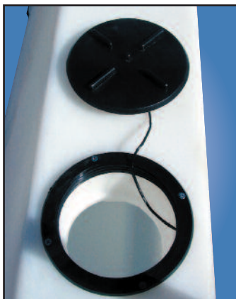
Tethered 5" lid and sash guard, standard on 75 & 100 gallon tanks.