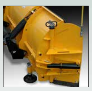
Each wing can be positioned independently.

Multi-Position Wings greatly improve the performance and efficiency of your Lot Pro moldboard. Each wing can be positioned independently to create a box, scoop or straight blade configuration (up to nine positions) with the pull of one pin.