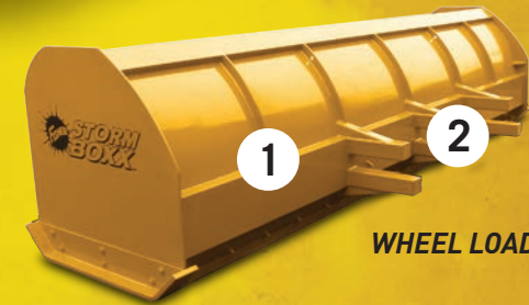
WHEEL LOADER MODEL