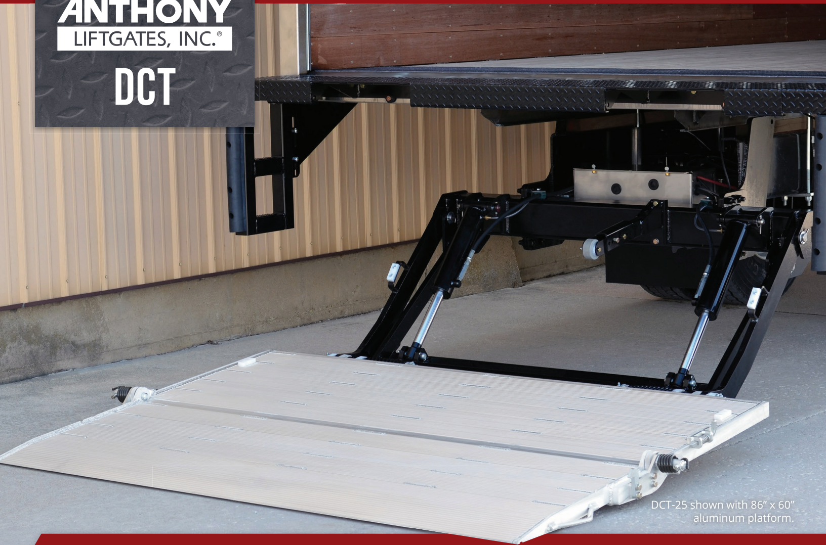
DCT-25 shown with 86" x 60" aluminum platform.