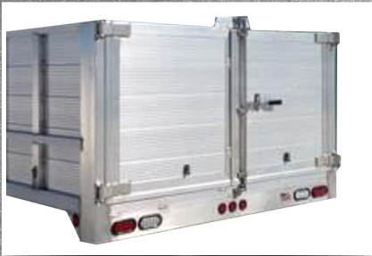
Barn Doors - Standard Feature