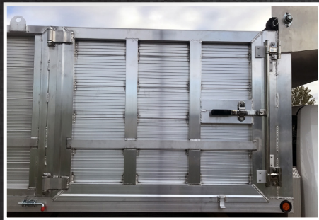
Optional 52" Wide Side Door

For more information, visit DuraMagTruckBodies.com