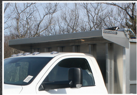
Optional Cab Shield up to 42"