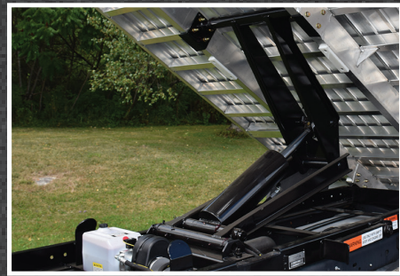
Optional Factory Installed Champion Hoist