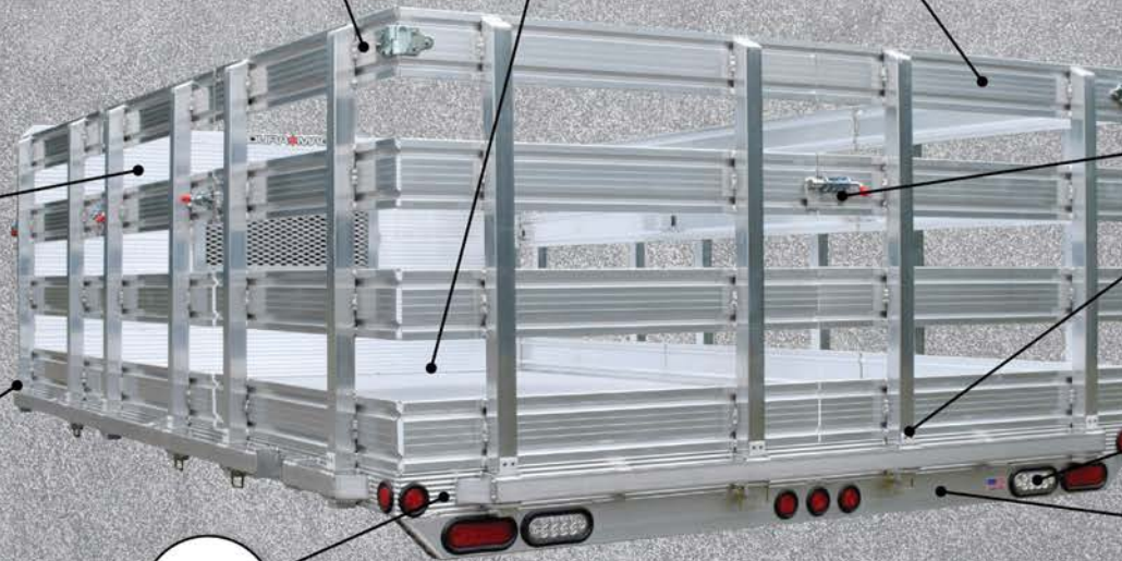
Interlocking Rear Racks