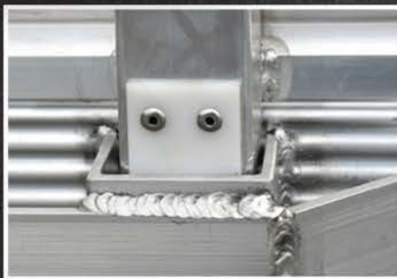
HDPE Strips Reduce Chaffing and Noise

For more information, visit DuraMagTruckBodies.com