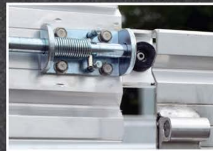
Rubber Grommets that Reduce Vibration