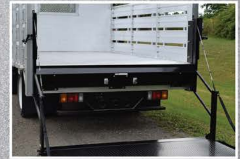
Optional Lift Gate Prep