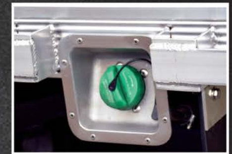
Optional Cast Fuel Filler