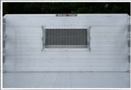
Fully-extruded Rugged Headboard