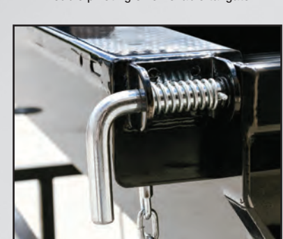
3/4" Diameter tailgate hitch pins