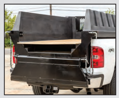
New design accommodates full sheets of plywood