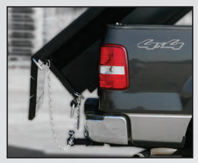
Double pivoting & removable tailgate