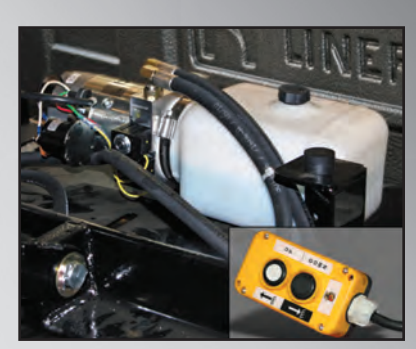
Power up & power down Monarch power unit with 10' tethered control box