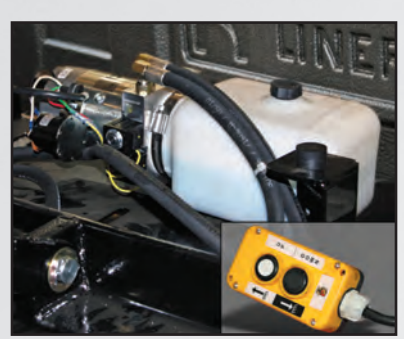
Power up & power down Monarch power unit with 10' tethered control box