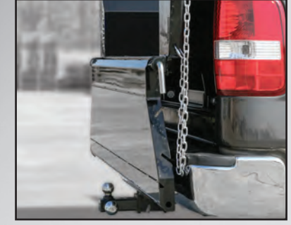
Double pivoting & removable tailgate