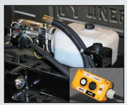
Power up & power down Monarch power unit with 10' tethered control box