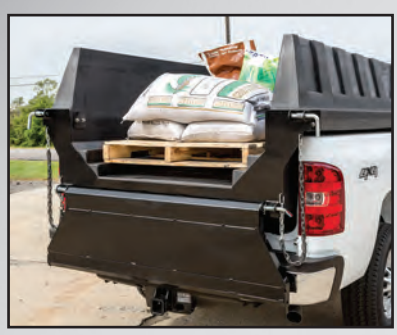
New design accommodates standard pallet