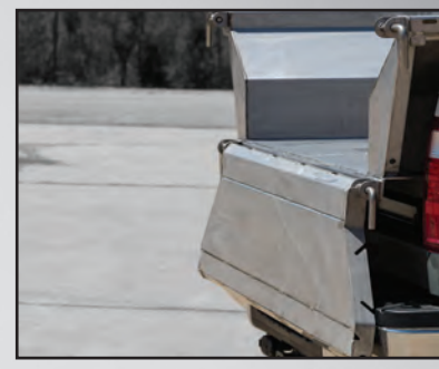
Double pivoting & removable tailgate