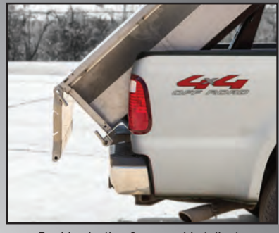
Double pivoting & removable tailgate