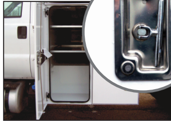
Standard reinforced door panels with durable 'T' locking latches

ARBORTECH offers truck tool boxes in an L-shaped configuration to maximize storage space on our forestry bodies. This helps to ensure the tools you need are always easily accessible at every job site.