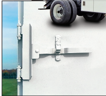
NEW Tailgate Cam Latch