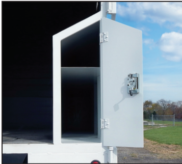
Ladder box with pole pruner shelf