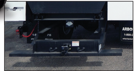
Standard hitch bar