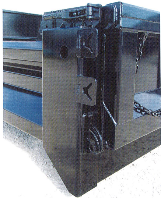
Pictured is a close view of the upper quick release hardware and banjo eyes of the standard PLD body. This hardware makes it easy to quickly remove and reinstall the tailgate as needed.

FULL FACTORY WARRANTY complete parts and service available through nationwide authorized distributors