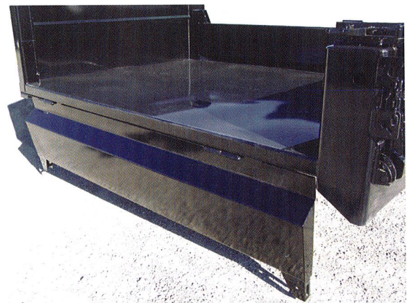
Pictured is a view of the 12' PLD drop side option. With the release of the two independent spring latches the side folds down below the floor. The 14' and 16' dropsides are split. (two sections each side)